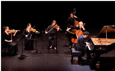
Members of the new ASO

Imagine the energy, passion and determination necessary to create, from nothing, a new symphony orchestra to represent an entire province!