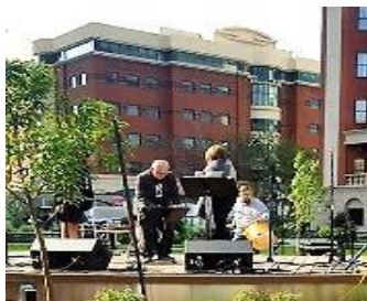
Conservatory Outdoor Concert Telus Park, August 28