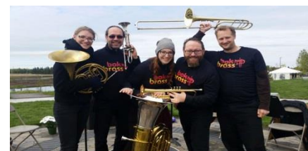
Bok Brass Kid's Concert and Fall Festival!